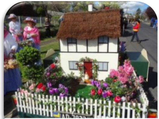
The English Country Cottage and garden complete with English Box tree, a peach tree and flowers

22 September 2012 (Saturday): Tulip Time parade. There were a number of members walking the route. Bob Bailey's classic and stylish Morgan will lead the way, pulling a trailer carrying our 2012 entry—an English country garden complete with cottage.