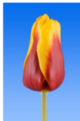
The new tulip

This experimental stage will take approximately twelve months and then, if all goes well, the new 'Bowral' tulip will be available for the 2015 celebrations for the 55 th Tulip Time. One persuasive factor for the breeders to name the new tulip Bowral (an aboriginal word meaning 'height') was that the colours are similar to those of the Aboriginal flag.