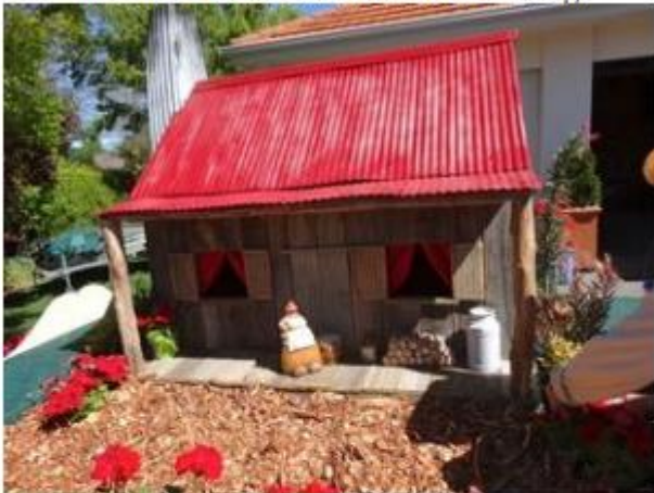
2013: The 1863 Australian settler's cottage