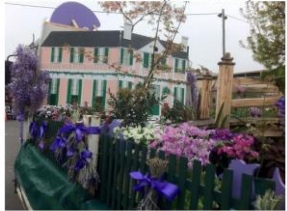
2011: Monet's house and garden at Giverny

22 September 2012 (Saturday): Tulip Time parade. There were a number of members walking the route. Bob Bailey's classic and stylish Morgan will lead the way, pulling a trailer carrying our 2012 entry—an English country garden complete with cottage.