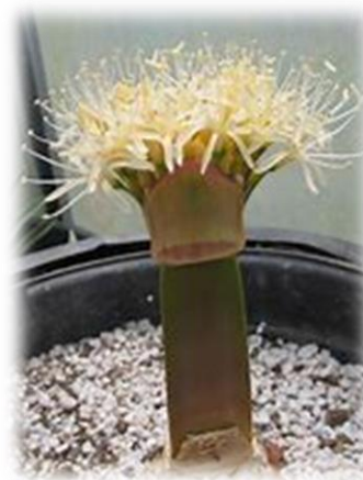
Flowering B. haemanthoides