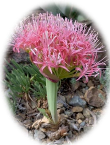
Flowering B. disticha